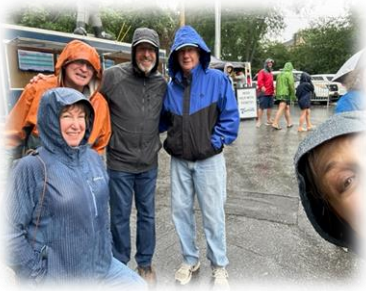
Rained out June 22

Thursday, August 24 Hike TBD, tentatively in Old Fort area then 11:30 AM meet at Hillman Brewery in Old Fort for lunch. If you don't want to hike, just join us there.