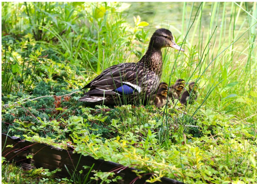
MOTHER MALLARD AND HER CHICKS AT THE POND