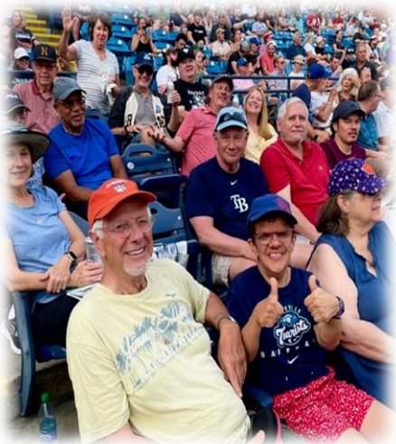
Tourist game June 29