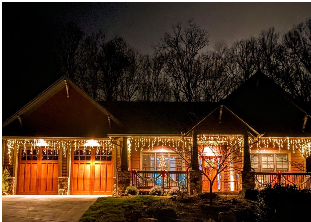
HOLIDAYS IN THE SETTINGS!