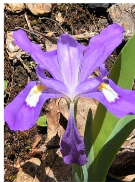
Dwarf Crested Iris