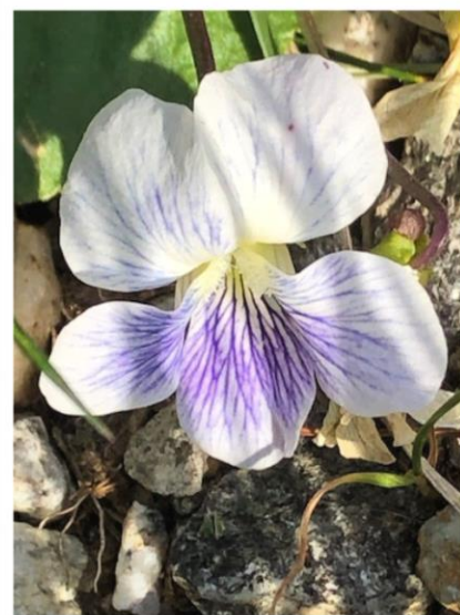
Sweet White Violet