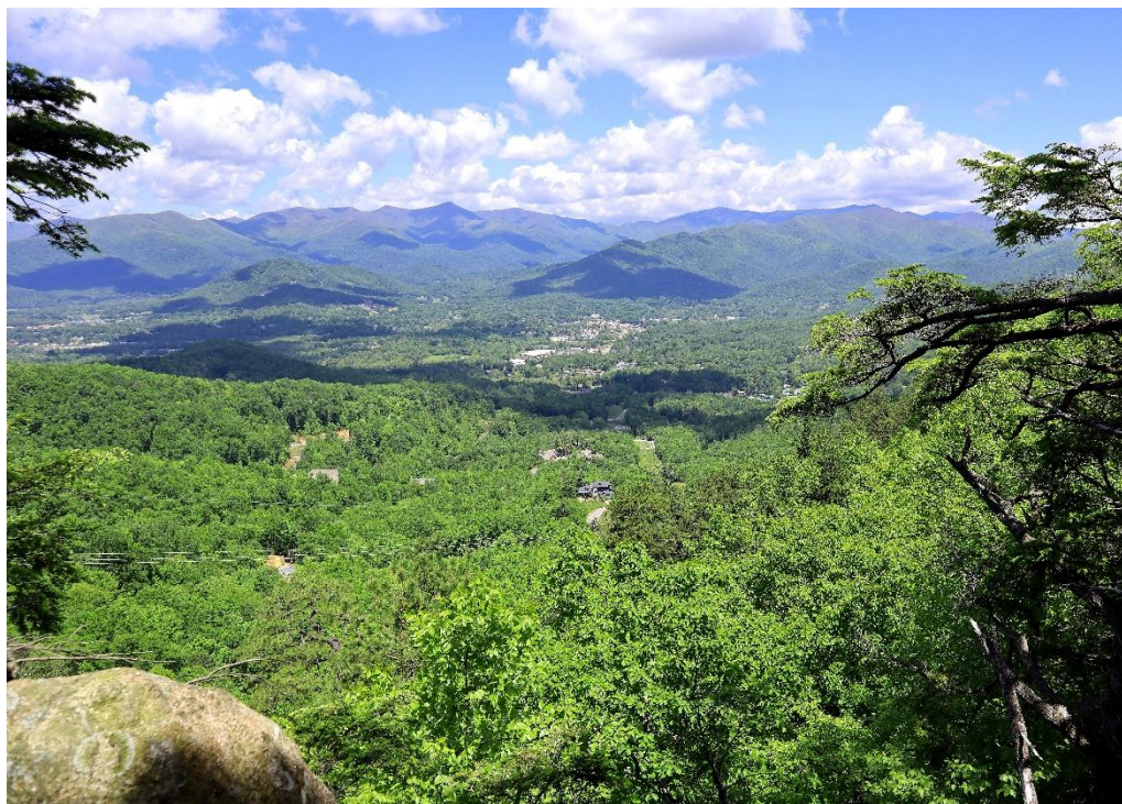
View from the summit of our upper trail